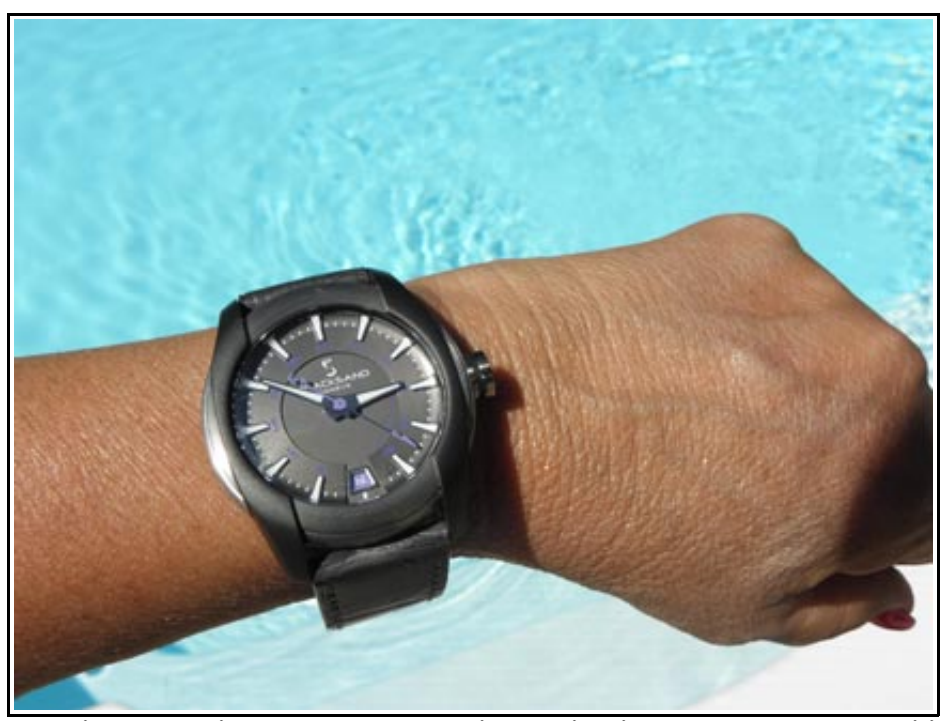
The Uniformity StratoMatic, crafted in sandblasted ceramic and titanium, offers easy readability and luminosity.

As the tagline "Elements of Time, Manufactured in Switzerland" intimates, the watches are crafted in Switzerland using high-tech materials such as tantalum (combined with rose gold), sandblasted ceramic and titanium. Each watch carries the words "Semper Fidelis," which labels the brand as a defender of watchmaking values and further underscores its commitment to "rise above the expected" in addition to adhering to strict codes of watchmaking conduct. In a tribute to armed forces, and drawing its inspiration from their feats, the watches bring strength, readability, high-tech materials and stealth looks to the forefront. They have expressive lines, alluring color palettes and a futuristically styled hourglass logo that can be multiply interpreted: as a yin/yang symbol, a serpent, and even infinity conveyed through the figure 8.