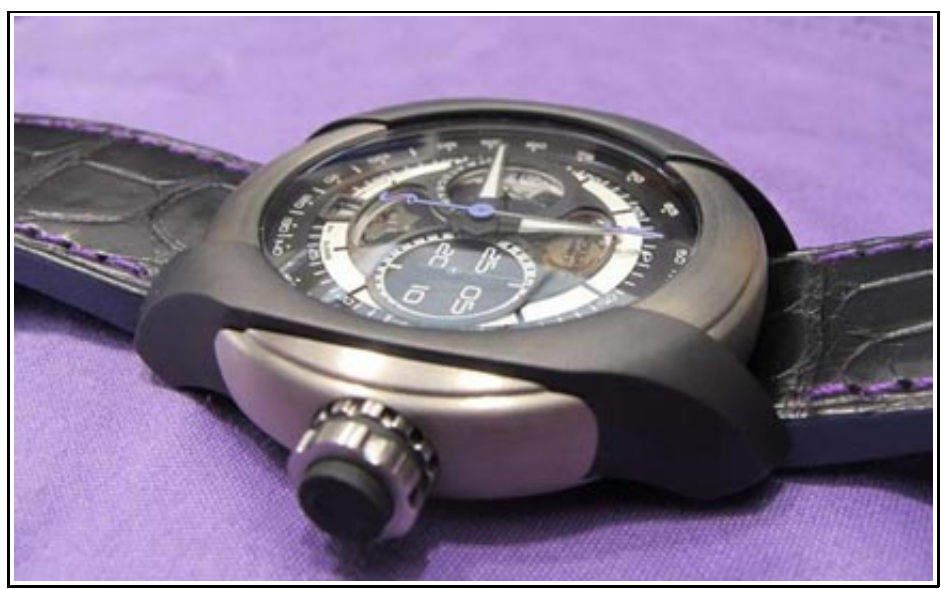
The Blacksand Stratographe is equipped with either a tachometer or pulsometer in addition to the monopusher chronograph.

Building on the Uniformity line and thanks in part to Cedric Johner, who joined the team in the spring, Blacksand has released a first chronograph called the Stratographe. Utilizing the same distinctive case, this watch is a monopusher chronograph that is available with either a tachymeter scale to measure speed or a pulsometer scale to measure heart rates.